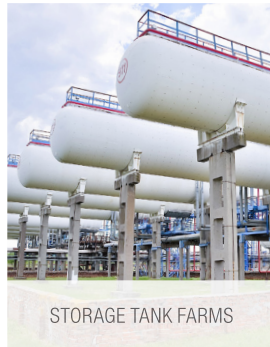
STORAGE TANK FARMS