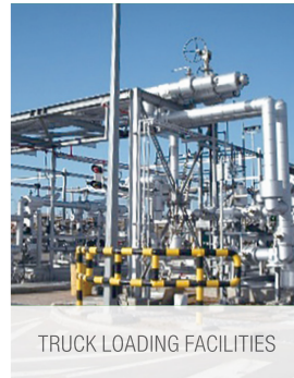
TRUCK LOADING FACILITIES